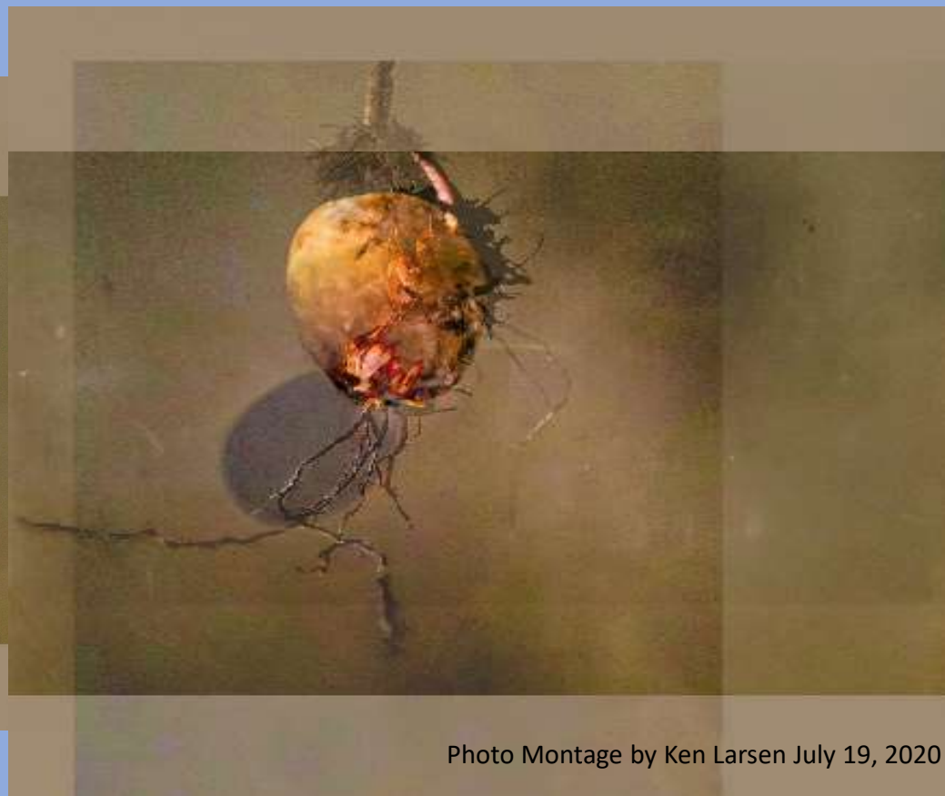
July 19, 2020